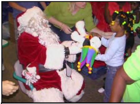
Children enjoyed a visit from Santa at the Caring Kitchen's Bounce Into the New Year party.